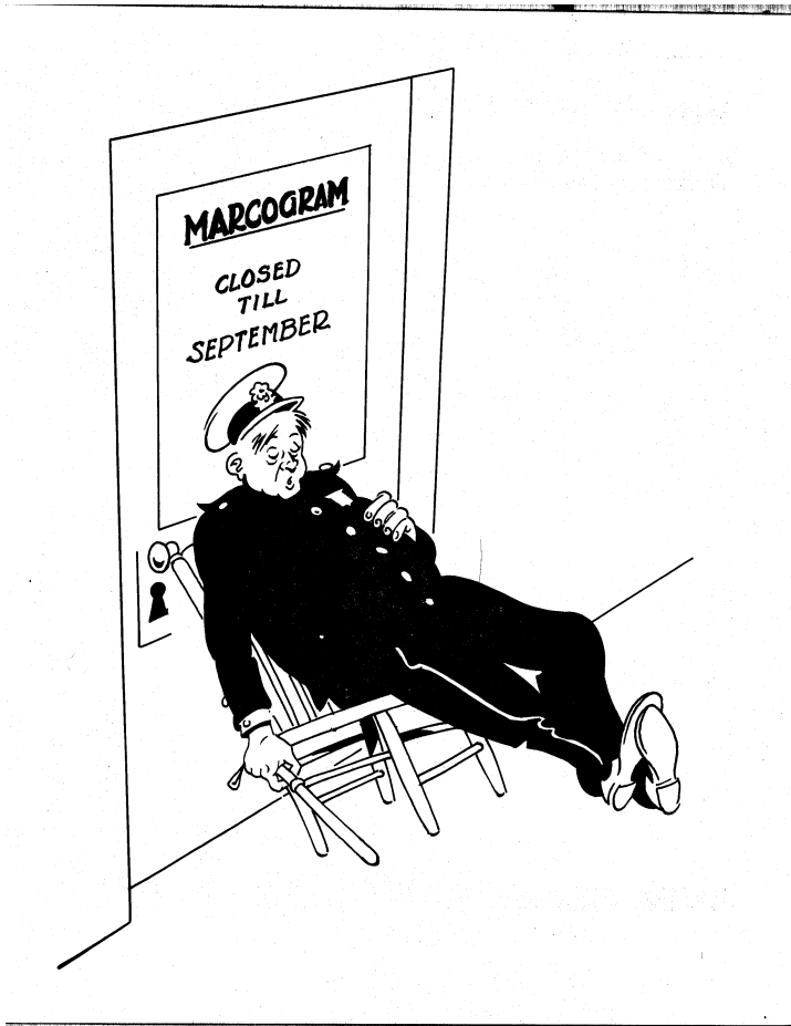
From the May 1972 issue of The Marcogram.