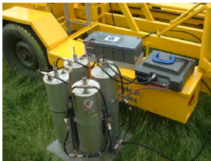
The repeater equipment used at Blainville this year.